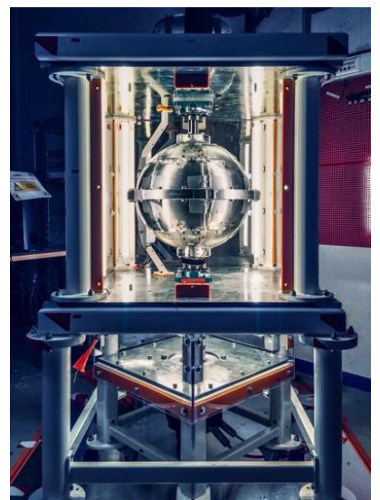
Photograph of the ZoRo experiment at ISTerre.