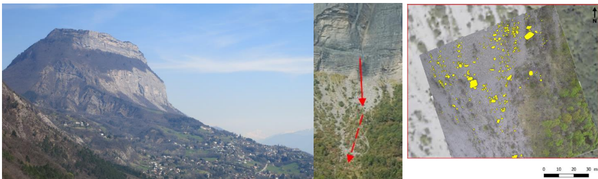
Fig. 1 The Mont Saint-Eynard limestone cliff (left); the 1500 m 3 rockfall (middle); orthophoto of some blocks of the 1500 m 3 rockfall.(right).

A methodology for impact frequency assessment is applied to the Mont Saint-Eynard cliffs, which overhang the Grenoble urban area (Fig. 1). The lower cliff is 240m high, separated from the 120 m high upper cliff by a ledge covered with forest. The upper cliff consists of massive limestone (bed thickness >1 m) while the lower cliff consists of fractured thin bedded (10–50 cm) limestone. The bedding planes dip inside the cliff. This anaclinal configuration, completed by subvertical fractures, produces overhanging compartments falling mainly by toppling.